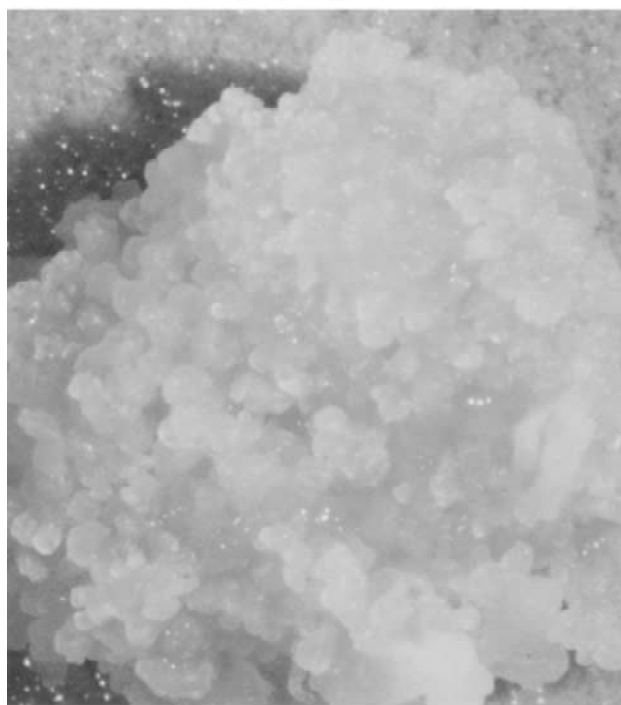
Figure 1. Callus cultures initiated from sorghum genotypes B T×630 (top) and B Wheatland (bottom).