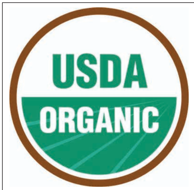
Figure 3—The USDA organic seal